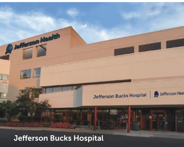
Jefferson Bucks Hospital