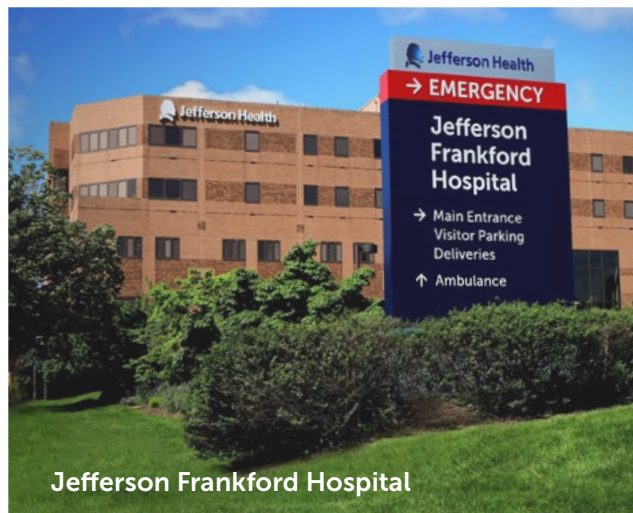
Jefferson Frankford Hospital