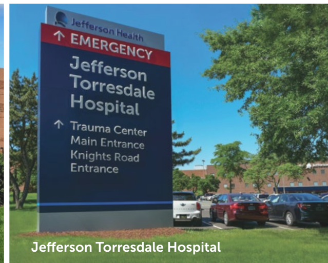
Jefferson Torresdale Hospital